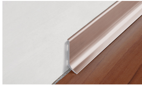
BRUSHED ALUMINIUM (silver-copper-titanium) thermo packed - bar length 2 lm - pack. 40 Pcs - 80 lm

"A" at the end of the product code = Item with adhesive