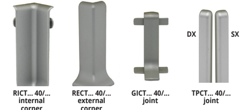
RICT... 40/... internal corner