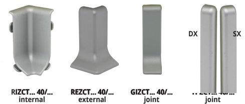
RIZCT... 40/... internal corner