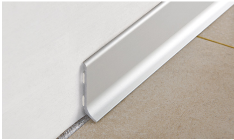
ANODIZED SILVER ALUMINIUM thermo packed bar length 2 lm - pack. 40 Pcs - 80 lm

ANODIZED, POLISHED, VARNISHED and BRUSHED ALUMINIUM