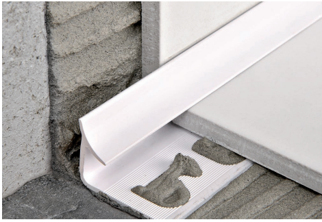
EXAMPLES AND INSTRUCTIONS FOR LAYING METHODS

SHOCKPROOF NON - TOXIC COLORED VINYL RESIN