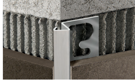
POLISHED STAINLESS STEEL AISI 304/1.4301-V2A with protective film bar length 2,7 lm - pack. 20 Pcs - 54 lm - 10/10 mm