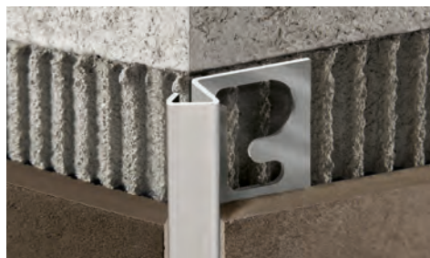
BRUSHED STAINLESS STEEL AISI 304/1.4301-V2A with protective film bar length 2,7 lm - pack. 20 Pcs - 54 lm - 10/10 mm