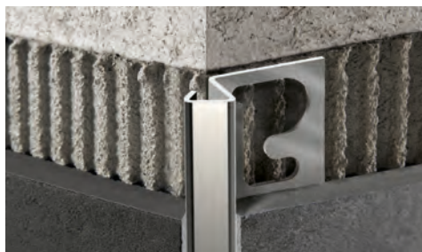
POLISHED STAINLESS STEEL AISI 304/1.4301-V2A with protective film bar length 2,7 lm - pack. 20 Pcs - 54 lm - 10/10 mm